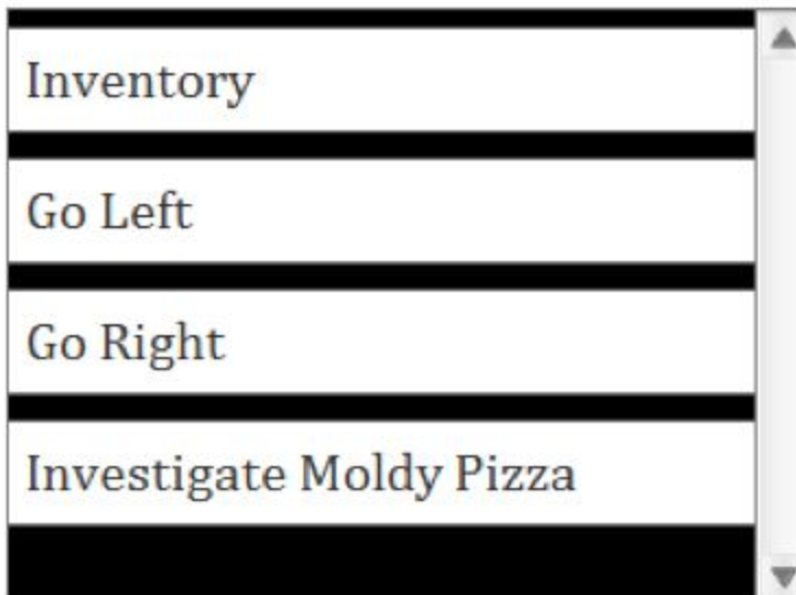
User Interface Example

You are in the third floor of the Zombie Bunker . Around you are many tables and chairs, mostly lined up against the left wall. It looks as though this area was used primarily for food stations during the zombie invasion of '06. There are still moldy shapes resembling pizza slices on the tables. There are a few doors, but all are locked. There is another hallway to your right, and a short hallway to your left.